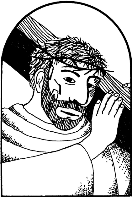
2 Condemned , Jesus receives the cross