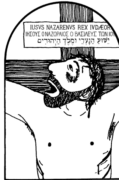
3 Jesus on the cross