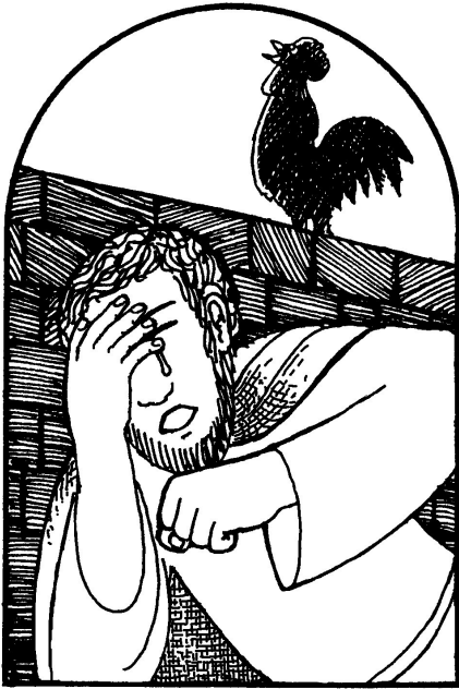
1 Peter denies Jesus