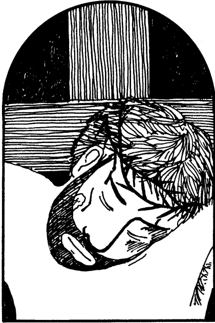
5 Jesus dies